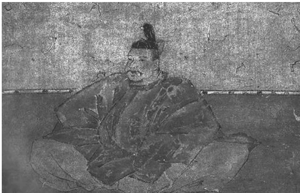
Fig. 3. Portrait of Tamba no Yasuori (912–995 CE)